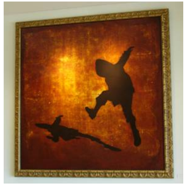
Jumping Boy and Girl ("Boy" pictured), Dorothy Rissman. Located at the south entry vestibule, third floor.